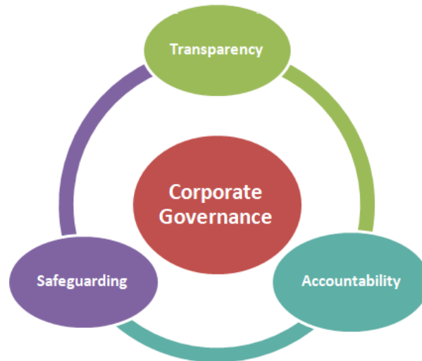
Figure 1: Three Factors of Corporate Governance

The Banking and financial sector is readily distinguishable from the others. A few distinguishing features stand out: