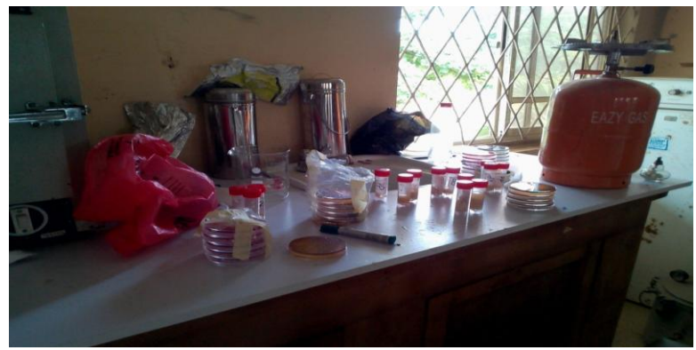
Figure 1: Laboratory Analysis procedures at Microbiology Laboratory of the College

Then, from the department of Medical Laboratory Techniques of the College where two MacConkey Agar and Chocolate Agar media were prepared using standard procedures and the contents from the universal bottles inoculated in the agars to detect and isolate any potentials pathogenic microorganisms (Chessborough, 2007), (Zohreh, et.al., 2015) and (Oje, et.al., 2016)