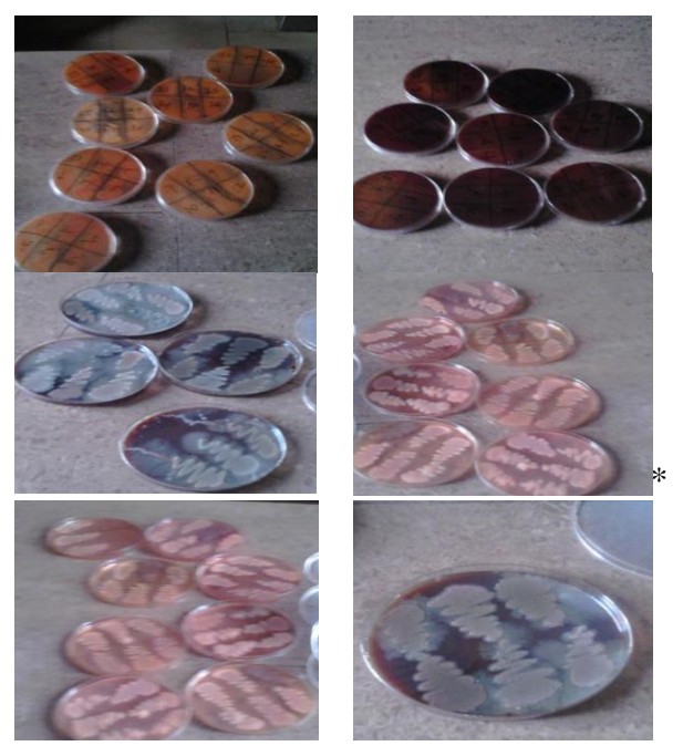
* Some of the results from blood agar medium used to compliment the analysis from MacConkey Agar Figure 3: Showing some of the pictures of pathogenic microorganisms detected

Out of ten (10) samples of Puff-Puff, nine (9) had Escherichia coli contamination, Klebsiella pneumonia were isolated from five (5) samples, while Staphylococcus aureus . isolated from two samples of the ten Puff-Puff collected for the study. On the other hands, with the sterile polythene bags, the contaminations were highly reduced, one (1) puff sample had Escherichia coli contamination, Klebsiella pneumonia were isolated from one (1) sample and while no Staphylococcus aureus . isolated from the sample of the ten (10) Puff-Puff samples collected by the sterile polythene bags.