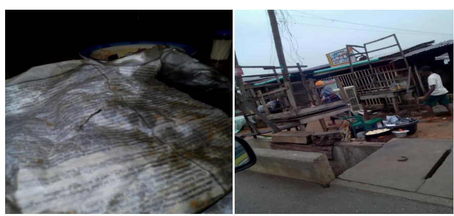
Figure 4: Showing used old newspaper for wrapping and vendor spot where puff-puff are prepared and sold closed to channel and main road

However, results of contamination of Bean cake with the microorganisms showed nine samples (9) out ten (10) collected with vendors packaging materials had Escherichia coli , three (3) contained Klebsiella pneumonia , and also three (3) of the bean cakes samples had Staphylococcus aureus . Then, the results of sterile polythene bags packaging indicated the detection and isolation of Escherichia coli in seven (2) of the samples, one (1) sample contained Klebsiella pneumonia and none contaminated with Staphylococcus aureus .