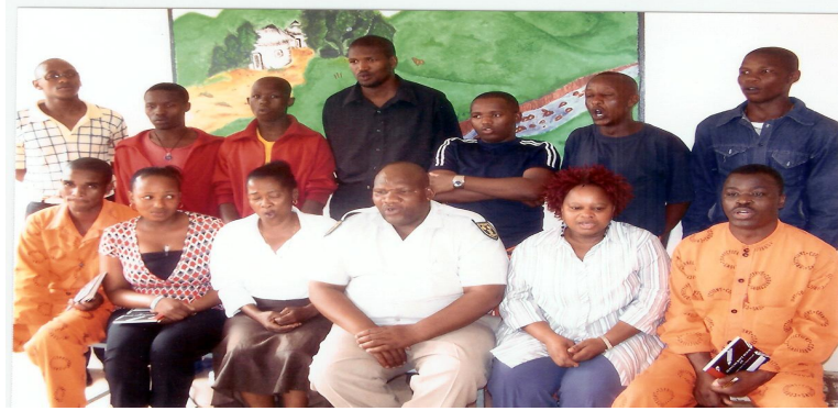
Fig 2 – 13 of the 16 action research leaders with the facilitator (front row 2 nd from the right hand)

Research (learning) took place in these music circles with the research leaders and their respective group members in the form of weekly, fortnightly and cycle-end meetings that were characterised by: